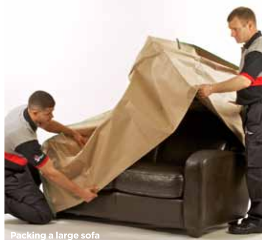
Packing a large sofa