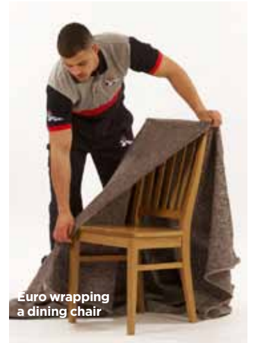
Euro wrapping a dining chair