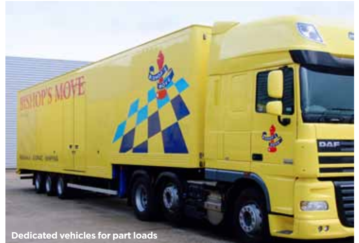
Dedicated vehicles for part loads