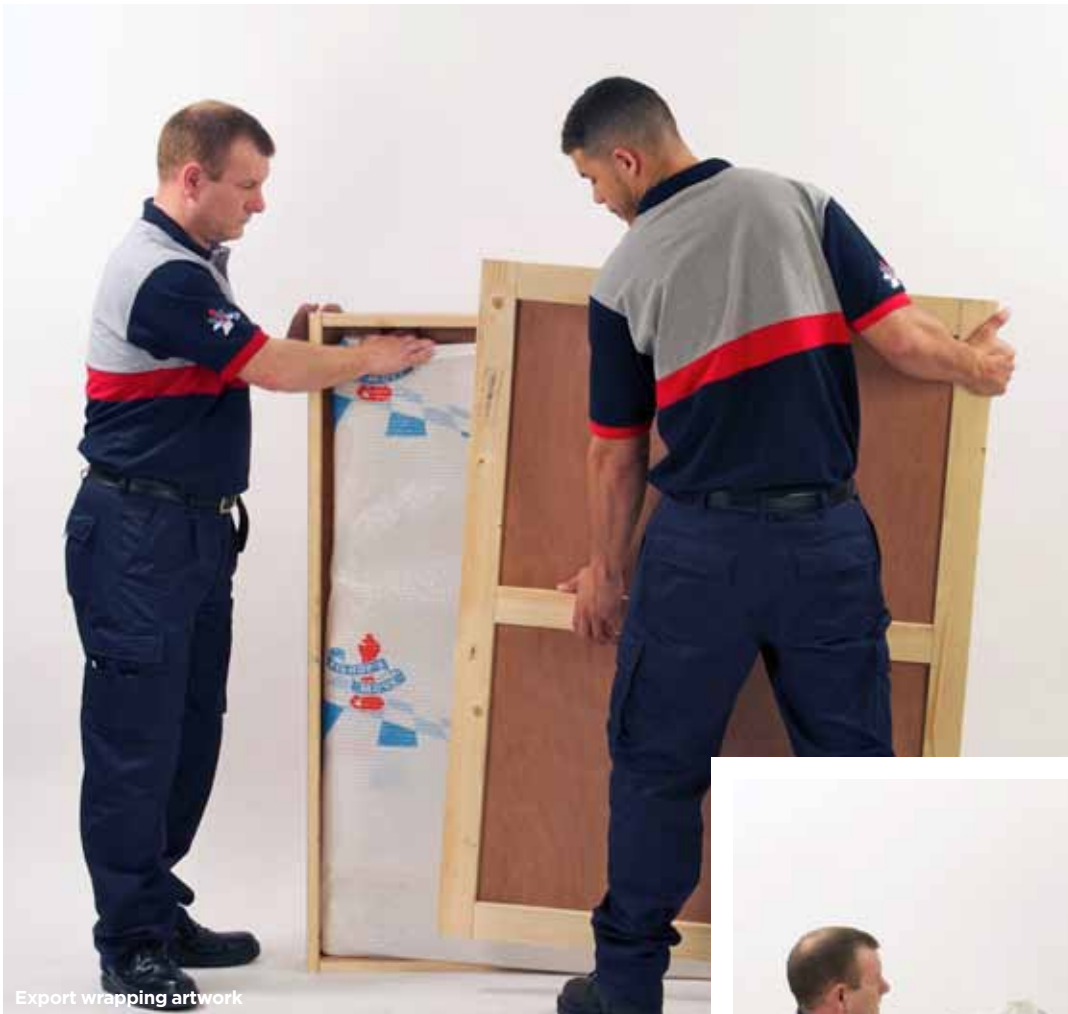
Export wrapping artwork