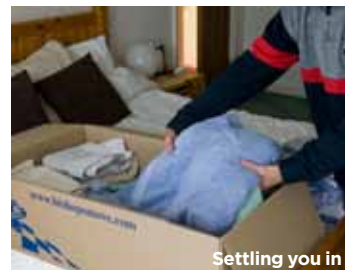
Settling you in