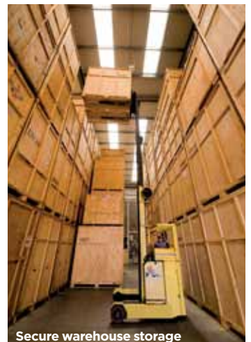
Secure warehouse storage