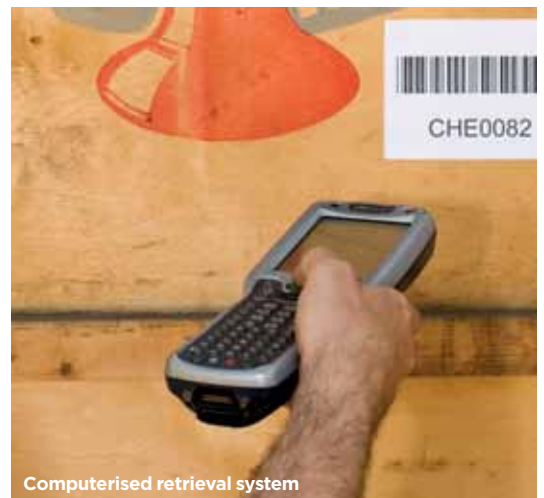
Computerised retrieval system