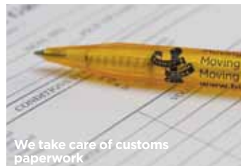
We take care of customs paperwork