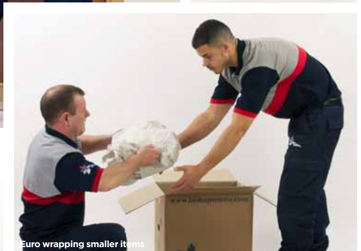
Euro wrapping smaller items