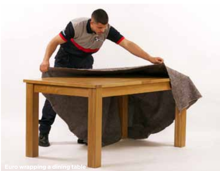
Euro wrapping a dining table