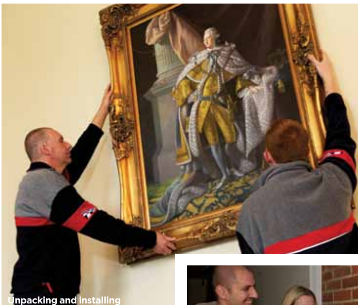
Unpacking and installing